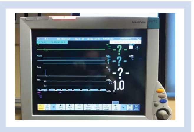
Fig 2 Capnography during CPR in a patient in cardiac arrest. The attenuated capnography trace is seen when pulmonary ventilation is occurring. A flat capnograph trace should be assumed to be because of oesophageal intubation (or rarely airway blockage) until this has been actively excluded.

Table 3 Incidence estimates of major airway complications by airway type for events and death/brain damage: expressed as events per million cases and fractions (one in n cases). The denominator for each calculation is from the Fourth National Audit project Census.<sup>15</sup> For each, point